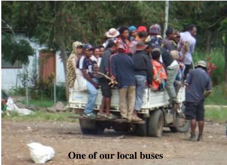
One of our local buses