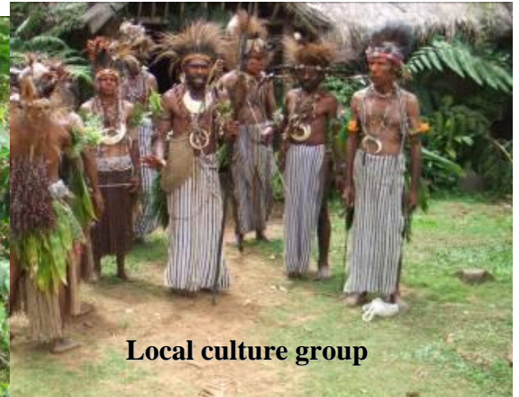
Local culture group