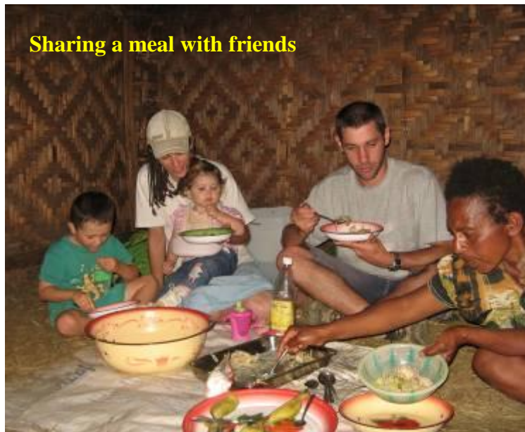
Sharing a meal with friends

You cannot pass a person on the road without having to stop and give a handshake and a greeting. It can be quite frustrating if you're in a hurry, but it has to be done because to rush the greeting process is to tell the person that you are not interested in them. They love it when we take an interest in their lives especially when we join in one of their activities. They seem to have the impression that white people are always busy and only want to talk when it suits them. We hope that we do not leave that impression on them. They have really accepted us as a part of the community and like everyone else we have to help in the community problems. Recently we had a pair of shoes stolen and someone tried to steal Ben's bike. When the people found out they were furious and tried their best to find the culprit. It makes for an exciting life!!