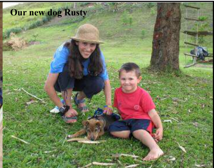
Our new dog Rusty