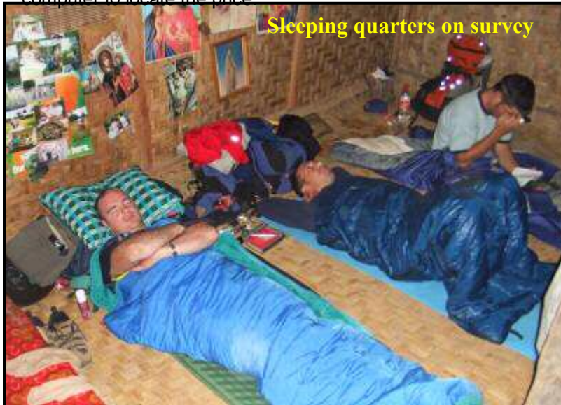
Sleeping quarters on survey

Building a house in a tribal location takes a lot of time to prepare for. Andrew and I went to price up some materials at the local hardware stores. What would take about an hour at B&Q takes all day. Nothing has prices marked on it so we had to write down all the part numbers and give them to the assistants who spend hours typing the numbers into the computer to locate the price.