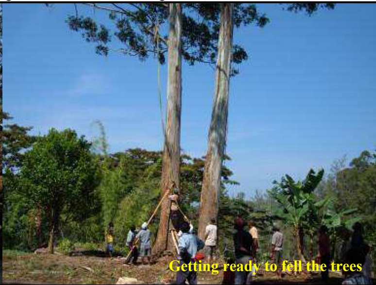
Getting ready to fell the trees