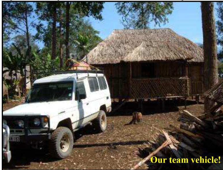
Our team vehicle!