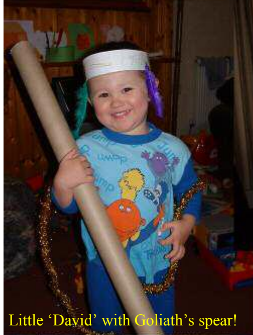
Little 'David' with Goliath's spear!