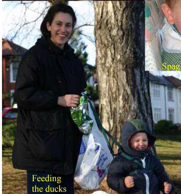
Feeding the ducks