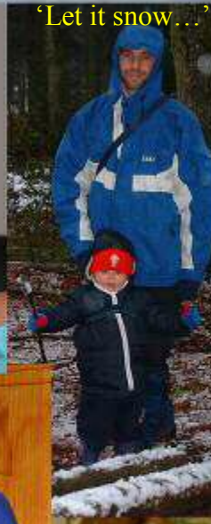
'Let it snow...'