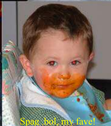
Spag. bol, my fave!