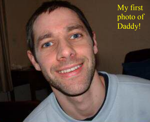
My first photo of Daddy!